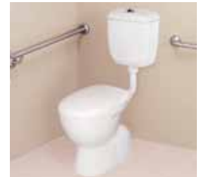
CAROMA CARE 400

✓ NEW! Care 800 range An Alternate Acceptable Solution*