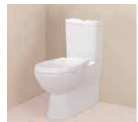
CAROMA OPAL II EASY HEIGHT

✓ Easy Height options for life style choice