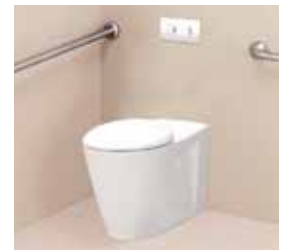
CAROMA CARE 800 INVISI II SUITE

✓ NEW! Care 800 range An Alternate Acceptable Solution*