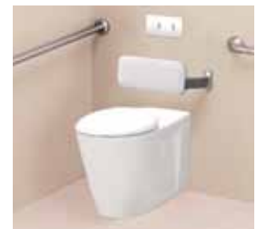
CAROMA CARE 800 INVISI II SUITE BACKREST SINGLE SEAT

✓ Easy Height options for life style choice